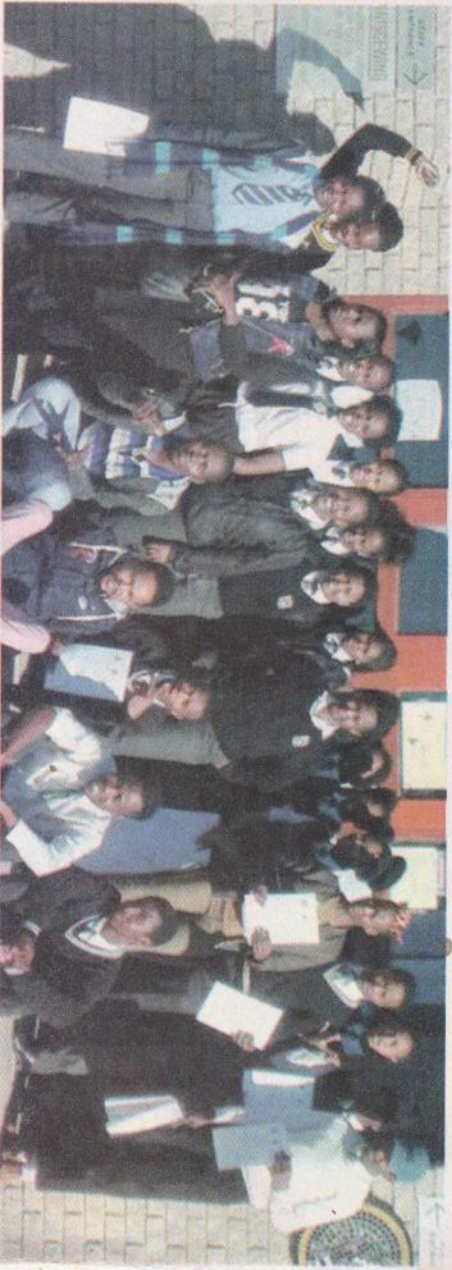
Participants in the Raphael Centre's ABCD programme.

After the school holidays, Raphael Centre staff will meet the project groups again to help with planning their activities and have more ABCD training with High Schools at the end of the last school term.